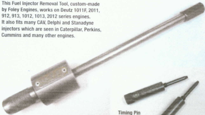
Timing Pin Set for Deutz 1011F/2011 series

This Fuel Injector Removal Tool, custom-made by Foley Engines, works on Deutz 1011F, 2011, 912, 913, 1012, 1013, 2012 series engines. It also fits many CAV, Delphi and Stanadyne injectors which are seen in Caterpillar, Perkins, Cummins and many other engines.